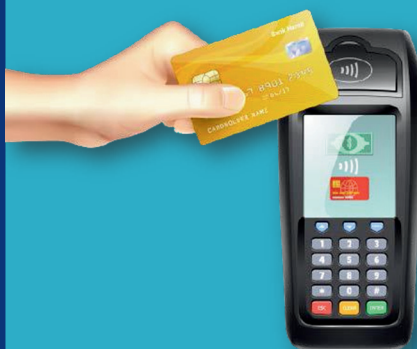
CURRENT EDC Terminal & Android based mPOS terminals